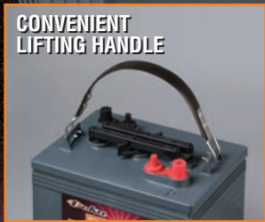
CONVENIENT LIFTING HANDLE

DEKA PRO MASTER EXCELLENT DEEP CYCLING POWER FOR ALL ELECTRIC VEHICLES. GOLF CARS, WHEELCHAIRS, PERSONNEL CARRIERS, FLOOR MACHINES, MARINE, AERIAL EQUIPMENT, ETC. MADE IN U.S.A. EAST PENN manufacturing co., inc. Lyon Station, PA 19536